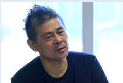
Shigesato Itoi Copywriter President, Hobo Nikkan Itoi Shinbun

“Everyone is focusing too much on “conveying” the information. What’s important is what comes before the “conveying.” People are interested in what you think about the disaster on March 11th and what kind of things you are truly committed to. They will ask what you are doing besides “conveying,” which seems much more important. “