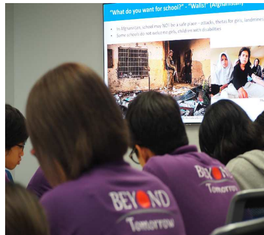
Session at UNICEF on child protection