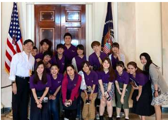
Visit to White House