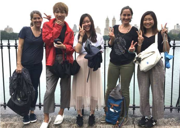
Family Day with host family