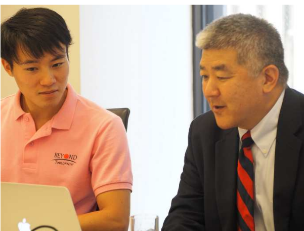
Session with Daniel Tani, Astronaut and Director, U.S.-Japan Foundation