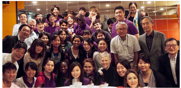
Dinner Party with professionals in DC