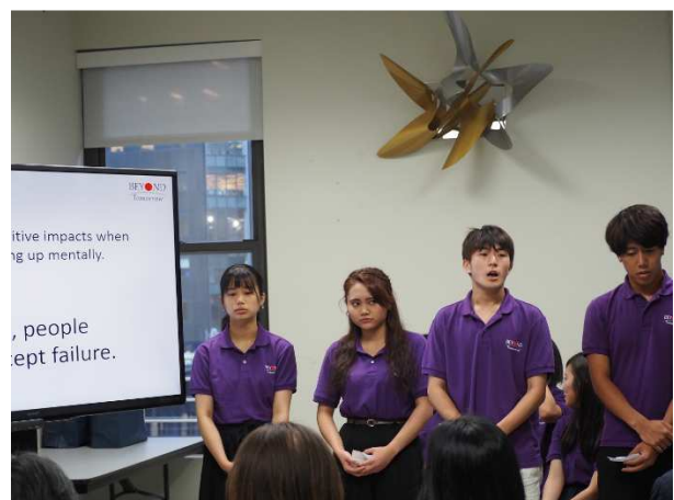
Final Presentation on the learning in the U.S.

We are all immensely grateful for all the support extended to make this special program possible. The students had an unforgettable experience that they would not have been able to afford themselves.